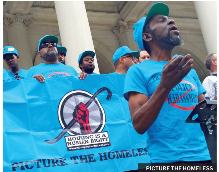
PICTURE THE HOMELESS