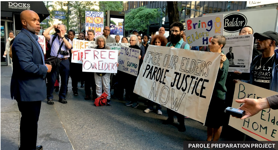
PAROLE PREPARATION PROJECT