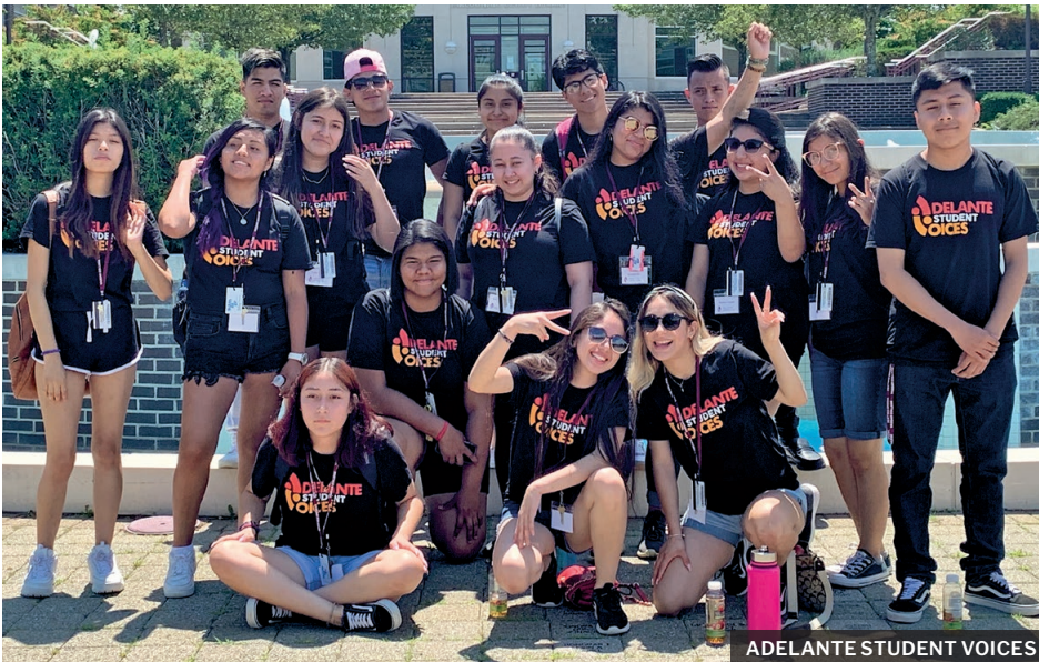
ADELANTE STUDENT VOICES