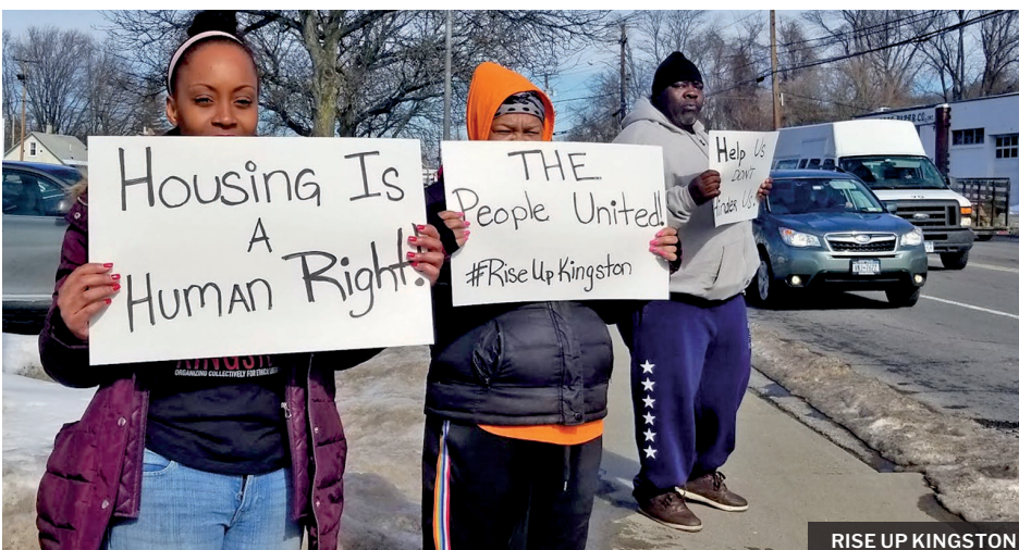
RISE UP KINGSTON

We're excited to support the vibrant power of New Yorkers taking on housing access, anti-immigrant and anti-LGBTQ violence, food security and other issues. Here are our 19 latest Hudson Valley grants—three-year awards totaling $655,000, with $275,000 moving into these communities in 2019.