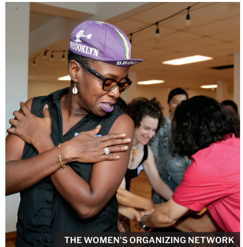
THE WOMEN'S ORGANIZING NETWORK